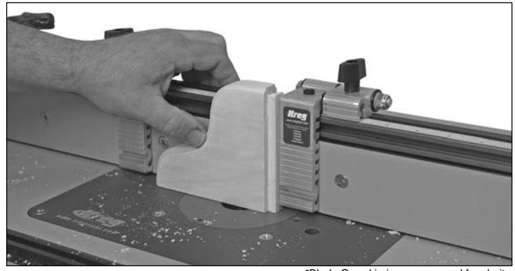
Blade Guard in image removed for clarity

WARNING: This product contains one or more chemicals known to the State of California to cause cancer and birth defects or other reproductive harm. Wash hands after handling.